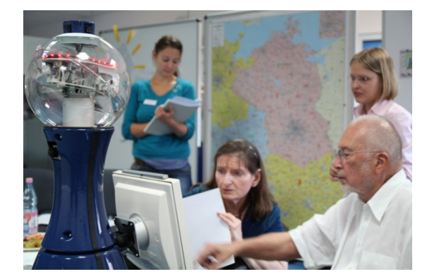
Figure 4: Seniors testing the different scenarios of the robot at the field trials.

The field trials are one important aspect in the development and evaluation of the robot platform. In the first field trials the three different scenarios of the robot (e.g. call-scenario, games-scenario, event-scenario) were tested with 14 seniors, six caregivers and care consultants. Both engineers and social scientists prepare and accompany the field trials [13]. By using written surveys, all test persons were asked about their attitudes, prospects and wishes before the test started and their impressions and suggestions for improvement after the test. The test phase normally took 20 minutes and the authors always tested pairs. Every scenario started with asking ALIAS for help (e.g. ALIAS come to me! ). After the robot goes to the senior who asked for help ALIAS greets the user. Then, the senior could choose one of the three provided scenarios. For example, by saying Please call Britta , a telephone call via Skype could be started. The control could be performed by speech, as well as via touch screen. The robot platform performed all of its tasks during the test autonomously [14]. Impressions can be seen in Figure 4 and Figure 5.